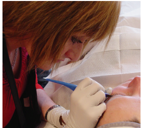
MEET OUR ESTHETICIAN

The Spa offers permanent make-up in addition to offering services such as massage, body polishing, skin care, facials, body waxing, pedicures, manicures, airbrush tanning and all related hair salon services such as haircuts, styling, perms, hair coloring, nails (artificial & nail art) and make-up.